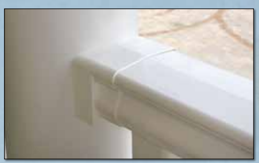
Brackets and adaptors are available for straight, corner, step and 8" and 10" round column post installations.