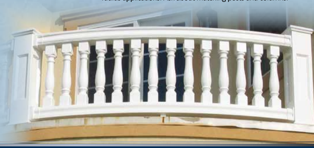
Both railing systems are available in curved sections for custom radius applications. Ask about matching posts and columns.