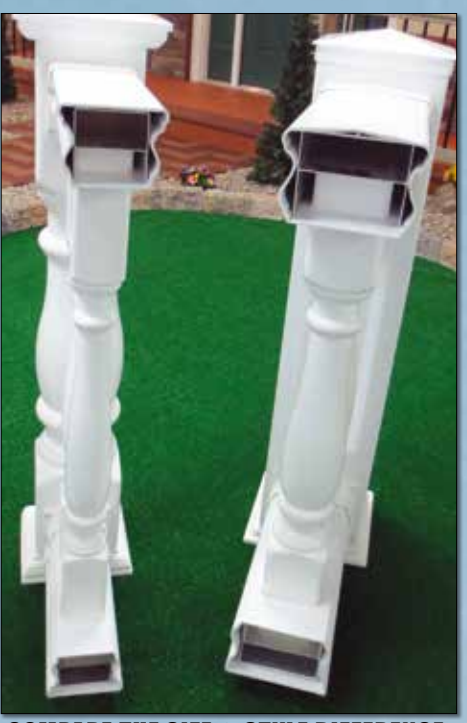
COMPARE THE SIZE & STYLE DIFFERENCE 5000 RAIL ON THE LEFT & THE 7000 TO THE RIGHT